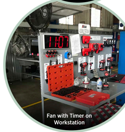
Fan with Timer on Workstation