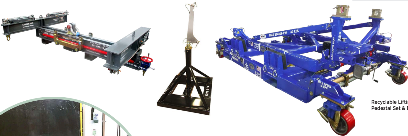
Recyclable Lifting Fixture, Pedestal Set & Engine Stand

The steel used in our GSE & Tooling contains less than 0.30% of carbon.