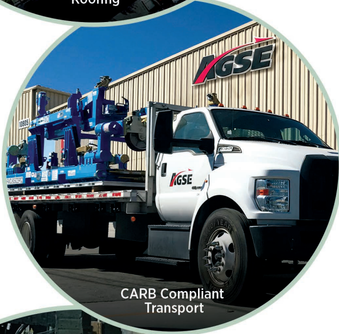
CARB Compliant Transport