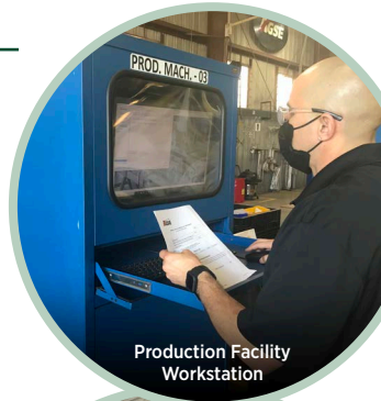
Production Facility Workstation

Over 60 certified ENERGY STAR® computers are used by our production, engineering, and operations teams, as well as by employees of our sister companies. In comparison to non-certified models, these workstations expend up to 65% less energy, use simple low voltage power without the need for battery backup, and can operate efficiently in multiple power-saving modes.