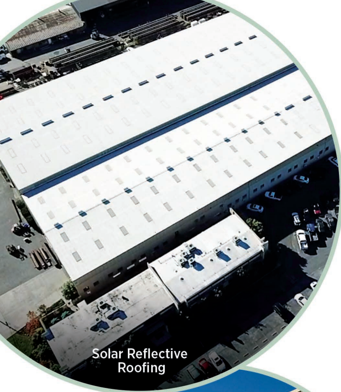
Solar Reflective Roofing