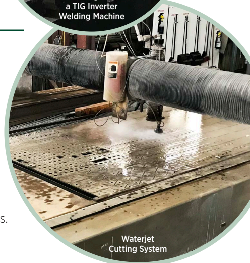
Waterjet Cutting System

Our waterjet machine not only operates at low electrical and abrasive consumption rates but also minimizes noise pollution to less than 80 decibels when operating in submerged cutting modes.