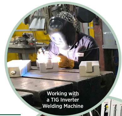
Working with a TIG Inverter Welding Machine

We use welding machines that reduce energy by up to 29 amperes for each unit when operating at a load input of 460 volts with a frequency of 60 hertz.