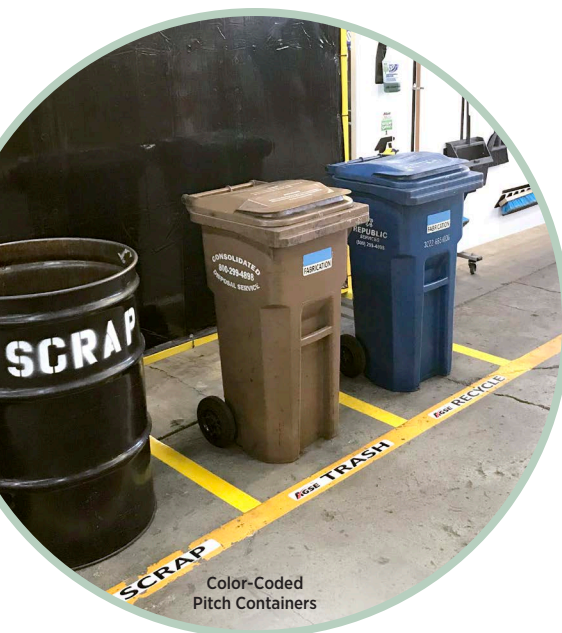
Color-Coded Pitch Containers