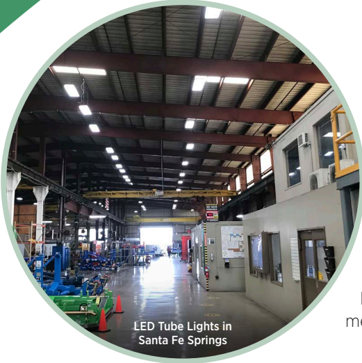
LED Tube Lights in Santa Fe Springs

Our Ohio Tooling Division office is lit by dimmable, DLC certified LED panels that deliver remarkable longevity. In the warehouse, we have transitioned from metal-halide lamps to fluorescents with reduced mercury.